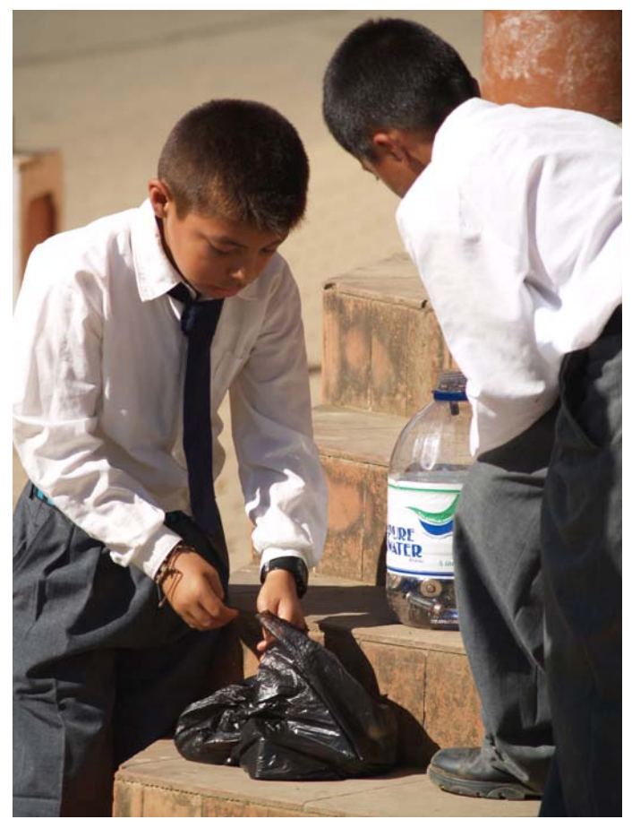
Figure 2. Children participate in the battery collection campaign.

My Community generated a lot of support from opinion leaders in the province, as this quote suggests: 'As a school authority, it is our mission to make spaces such as in the radio station available to students where they can interact with other students to talk about issues such as ecology or sexual health.